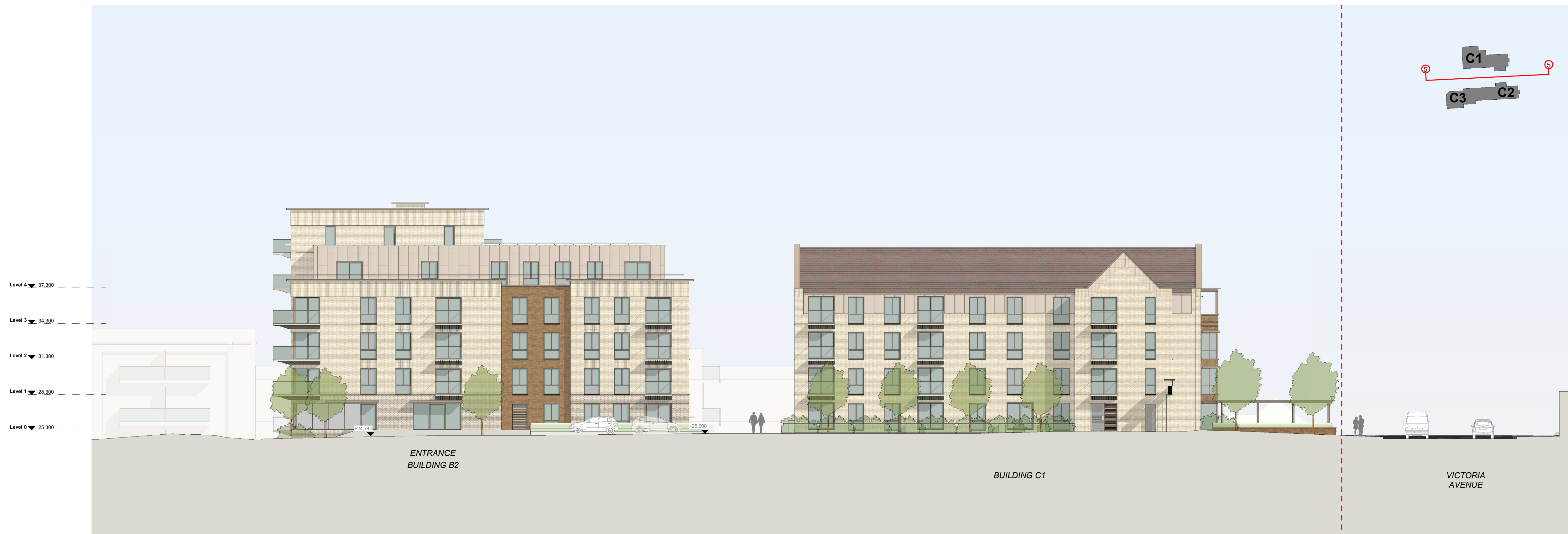
5 Elevation C1 South 1:200