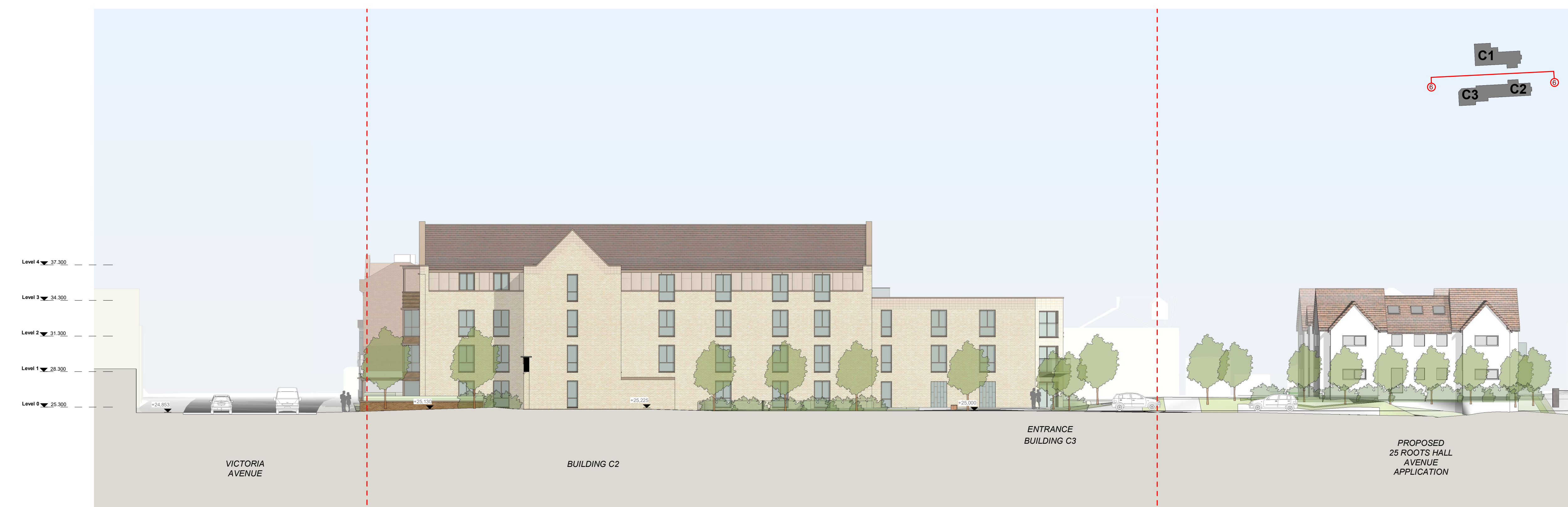
6 Elevation C2_3 North 1:200

Rev: P03 Date: 12.02.2021 Drw: KW Chk: SG Victoria Avenue Bays, Windows and Louvres Amended Rev: P02 Date: 09.09.2020 Drw: KW Chk: SG Victoria Avenue Bays, Front Garden Landscape Rev: P01 Date: 13.09.2019 Drw: FD Chk: SG Planning Issue